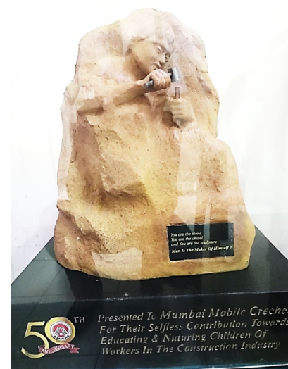
Memento received from Ajmera Realty

In the coming pages we are delighted to share with you about the several special events and activities held at our centres during the past six months.