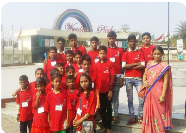
Children enjoyed a day out at Wonder Park, Navi Mumbai

We collaborated with Apni Shala Foundation to conduct sessions on life skills for children in the age group of eight to fourteen at one of our centres in Thane. The sessions aimed to enhance their self-confidence and communications skills. Through sessions held twice a month for two hours each, the facilitators covered topics ranging from teamwork, self-awareness, leadership, self-confidence, respect for different opinions and empathy.