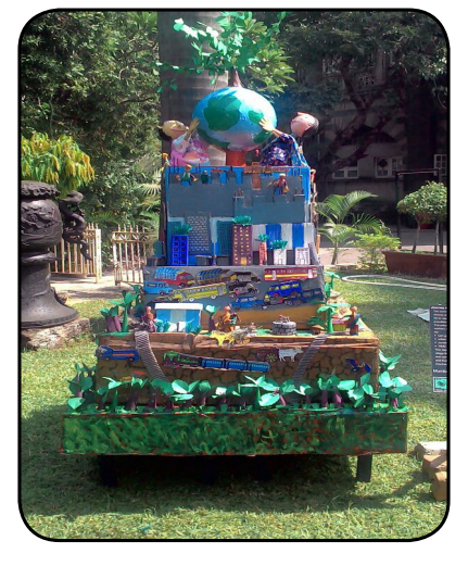
Art Installation at Kala Ghoda

We also showcased our work in property expositions at an event organised by MCHI CREDAI at the Bandra Kurla complex as well as at an event with the Ashar Group at Thane.