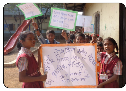
An Awareness Rally during Book Week

In addition, 25 teachers from our centres participated in a workshop designed to enhance their story reading skills.