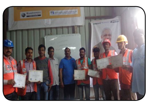
Towards A Better Livelihood

MMC collaborated with Jan Shikshan Sansthan (JSS) and Rustomjee Academy for Global Careers (RAGC) to provide skill building opportunities to our community of construction workers. As a result of these initiatives: