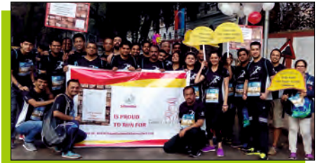
Corporate supporters running for MMC

The Standard Chartered Mumbai Marathon was organised this year on 15th January. The Mumbai Marathon is the biggest annual fundraising event for MMC. Four corporate partners having over 200 runners along with 30 individual runners ran to support the cause of children living on construction sites. This year two youths from a construction site, who are our alumni, ran for MMC to demonstrate their support for the cause of migrant children.