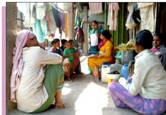
Chai-pani meeting in the community