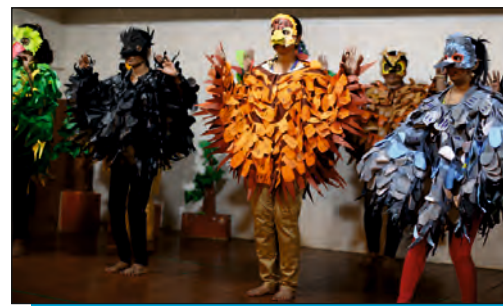
Performance by BPT Trainees