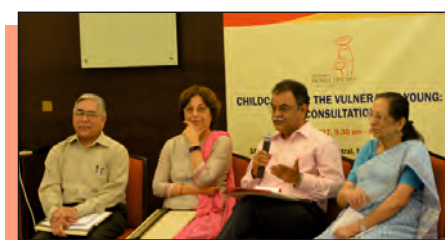
Panel discussion at the ECCE Consultation

Since challenges faced while working with children of birth to six years of age rarely get articulated at a common forum, MMC organised a consultation on Childcare for the Vulnerable Young on 10 th March. More than 50 participants from various civil society organisations working in the area of childcare attended the event. They discussed the ground realities of accessing quality childcare, challenges in implementing ECCE within or in collaboration with government services and about strategies in building networks and resolving challenges. At the end the participants expressed a need for follow up sessions to further accelerate the process of change.